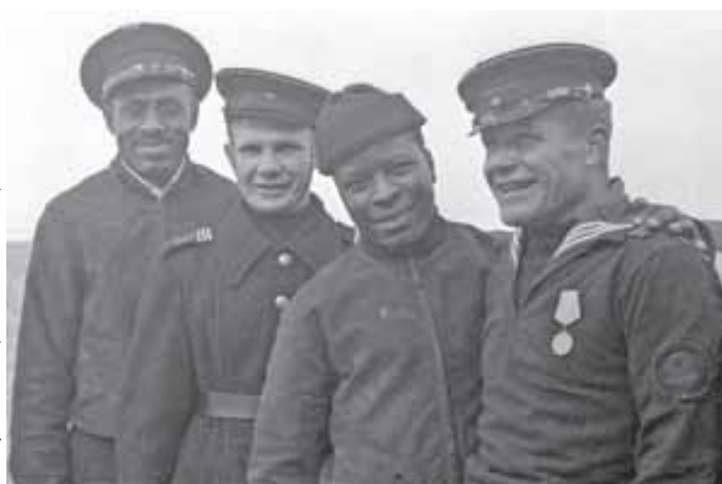
Soviet and US navy personnel on the warship "Milwaukee", 1944