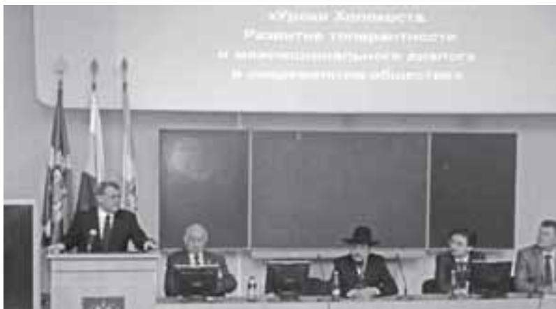
Opening the seminar in Stavropol

• From February 15–16, an educational seminar “Lessons of the Second World War and the Holocaust: Overcoming Ethnical Stereotypes and Educating Tolerance” was conducted at N. Ushynski Yaroslavl State Pedagogical University for the teachers of