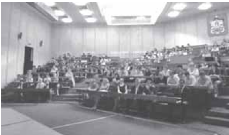
Seminar at the North Caucasian Federal University

was conducted at Kemerovo State University. It was attended by more than 70 participants from Kemerovo (city and district);